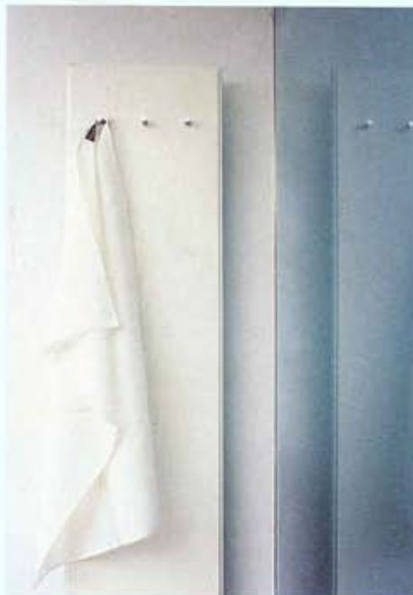
WALL-MOUNTED RADIATOR ABOVE LEFT: flat-panelled radiator with chrome pegs, from a selection, Bisque. Medium linen towel, from £23, Acca Kappa.