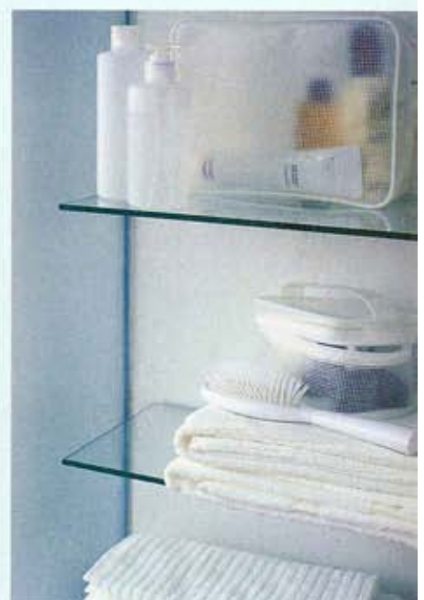
x 80 H x 46cm D), £340, Samuel Heath & Sons. On bath surround, from top: bath sheet, £29.50, Designers Guild. Linen towels, small, from £16.80, and large, from £49.50, Acca Kappa. Ribbed towelling bath mat, £8, The White Company. On trolley: bottom shelf: bath towel, £39.95, Aria. Ribbed hand towel, as before. On middle shelf: 'Classic' bath sheet, £19.50, The White Company. Hand towel, £6.99; bath towel, £12.99, both Next Home. On top shelf: silver mesh wash bag, £10, Heal's. On glass shelf: wash bag and toiletries, stylist's own.