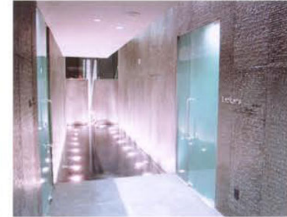
Left: Treatment rooms are spare and contemporary Right: Locker rooms are lined with articulated white stone