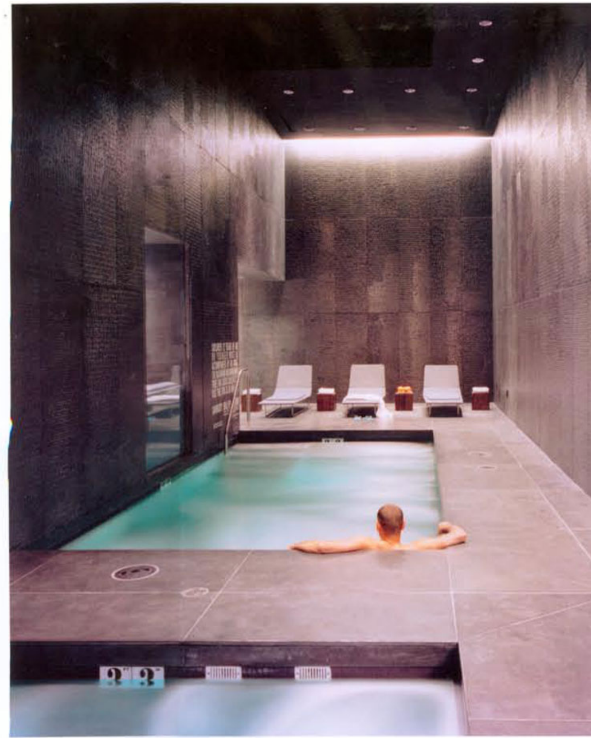
Above: Hot pools and clear surfaces give a meditative atmosphere Right: Free-flowing floor plan leads to pools and lounges