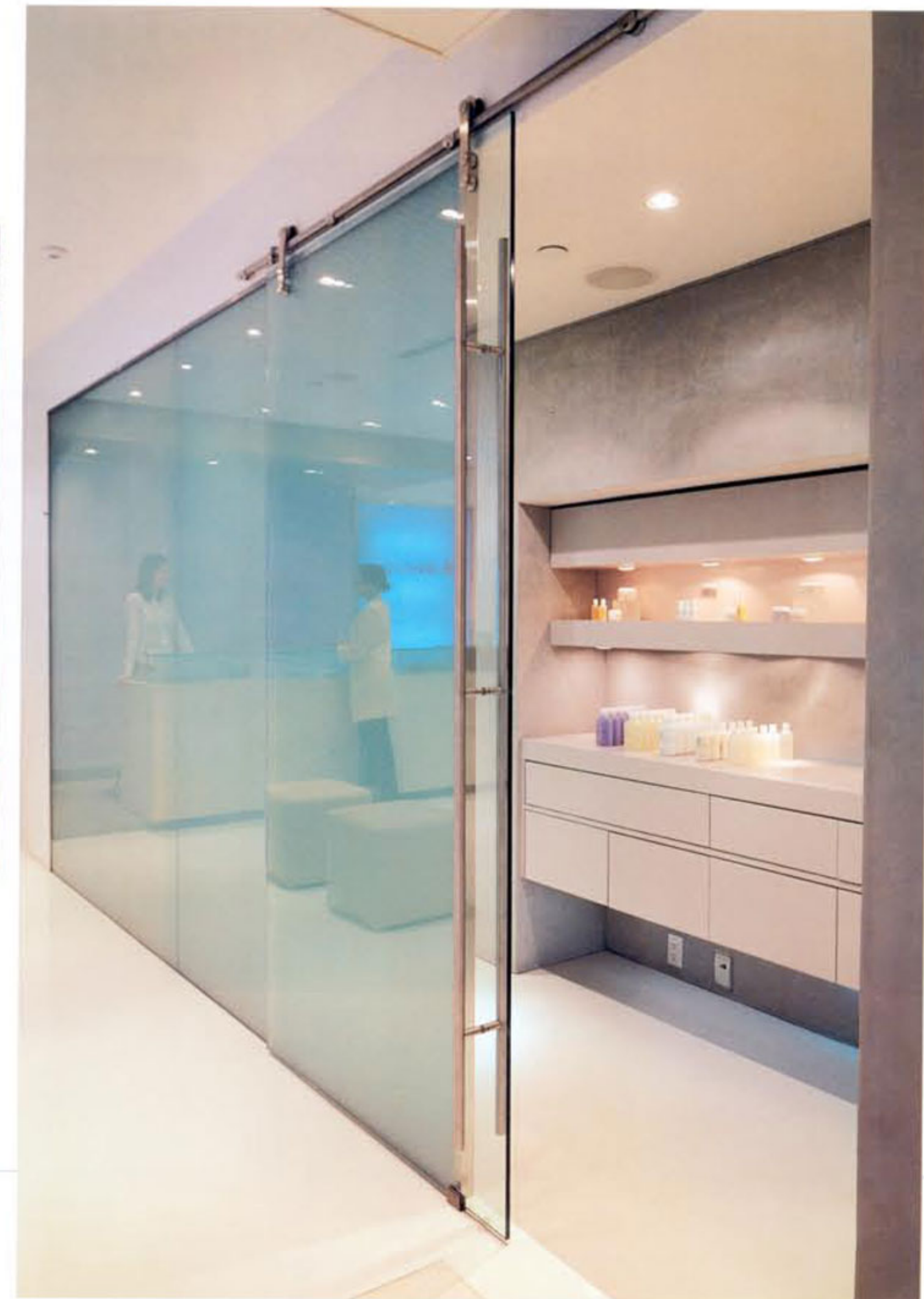
Above: A path through the water delivers you to Skinklinic Right: Transparent and translucent surfaces evoke layers of radiant skin