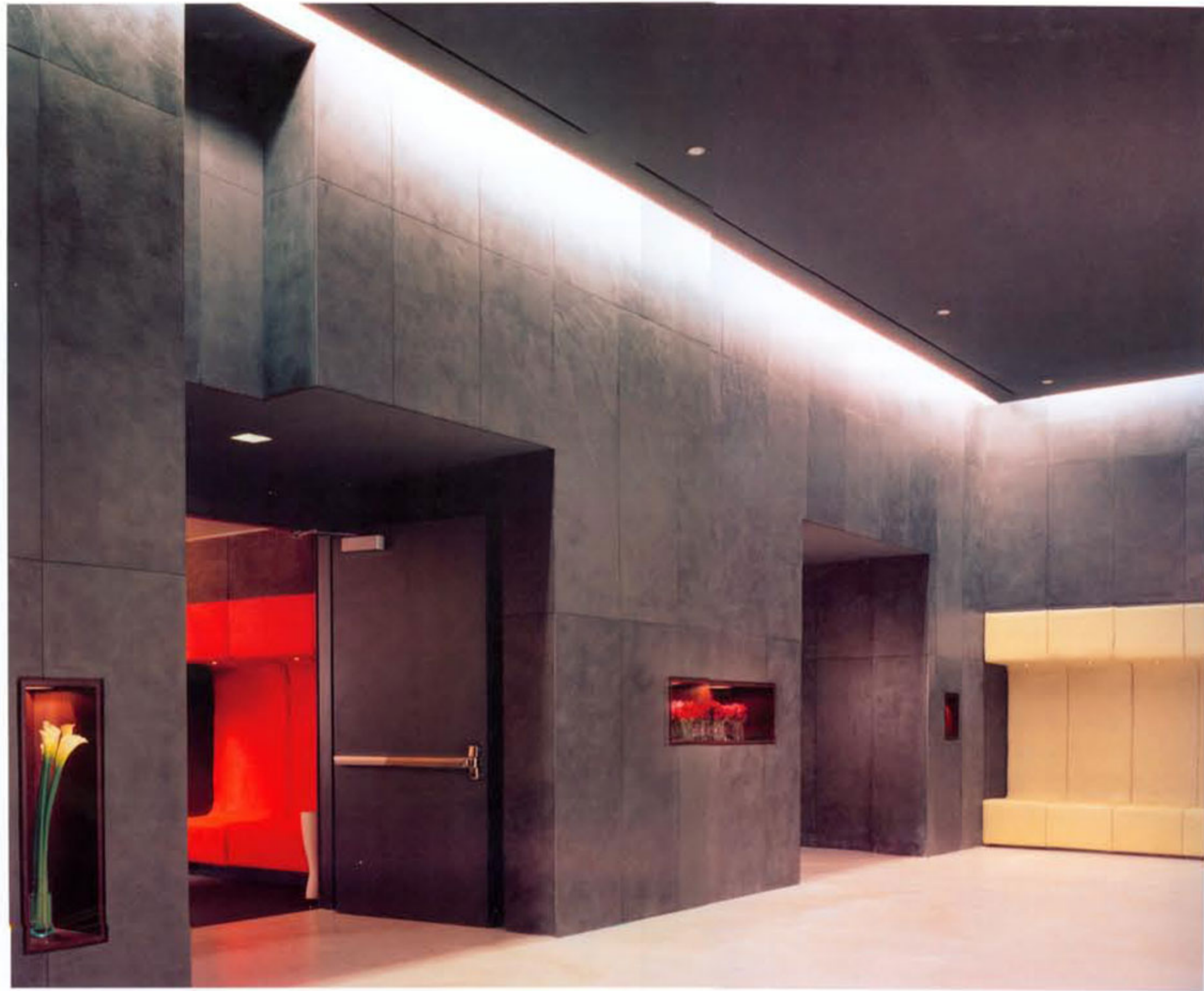
The seductive spa is on the second floor of The Hotel