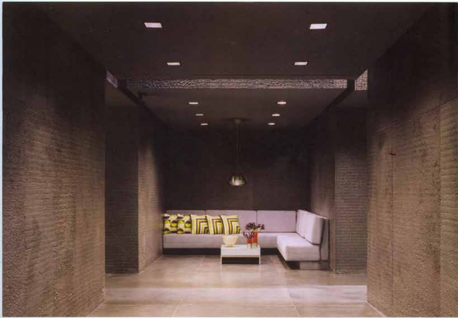
The bereft surfaces of the lobby provide the atmosphere of privacy that was sought by this spa, which provides an oasis of serenity from the bustling noise of Las Vegas.