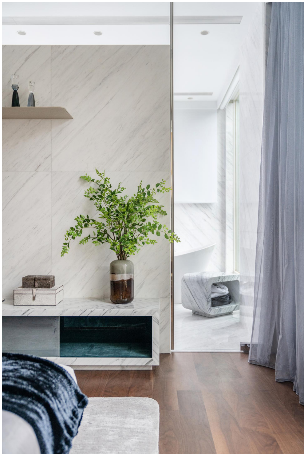
Interior details of the master suite at the Sky Duplex.

‘In designing The Morgan Sky Duplex, I was inspired by the lush green expanse of Victoria Peak on one side and the Hong Kong